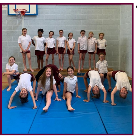
All year gymnastic reward

There have been numerous Epraise reward sessions this week with pupils spending their hard-earned candle credits - it has been great to see so many pupils enjoying themselves - when it's hard-earned it's all the more enjoyable!