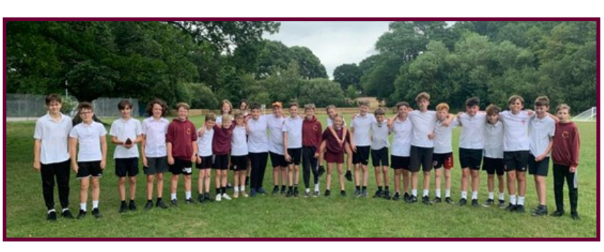
Year 7 and 8 Capture the Flag