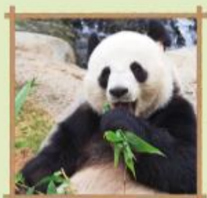
The Giant Panda Bear